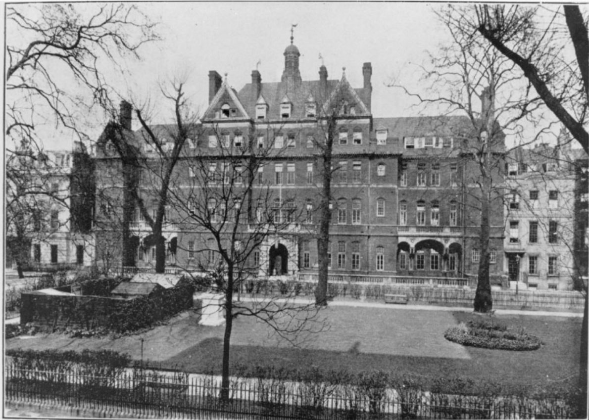
NATIONAL HOSPITAL, QUEEN SQUARE, FRONTAGE.